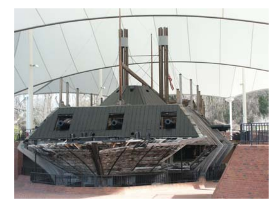
Union gunboat Cairo at Vicksburg, MS.

We are most honored to have this outstanding historian back with us again.